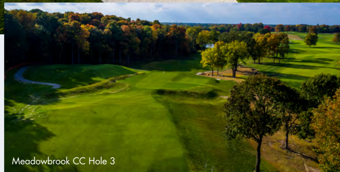
Meadowbrook CC Hole 3