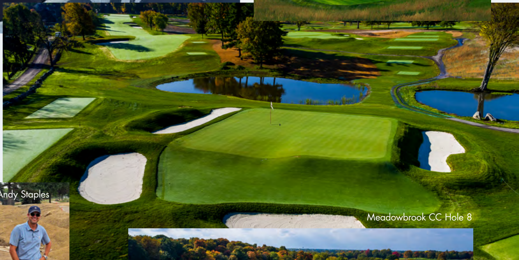
Meadowbrook CC Hole 8