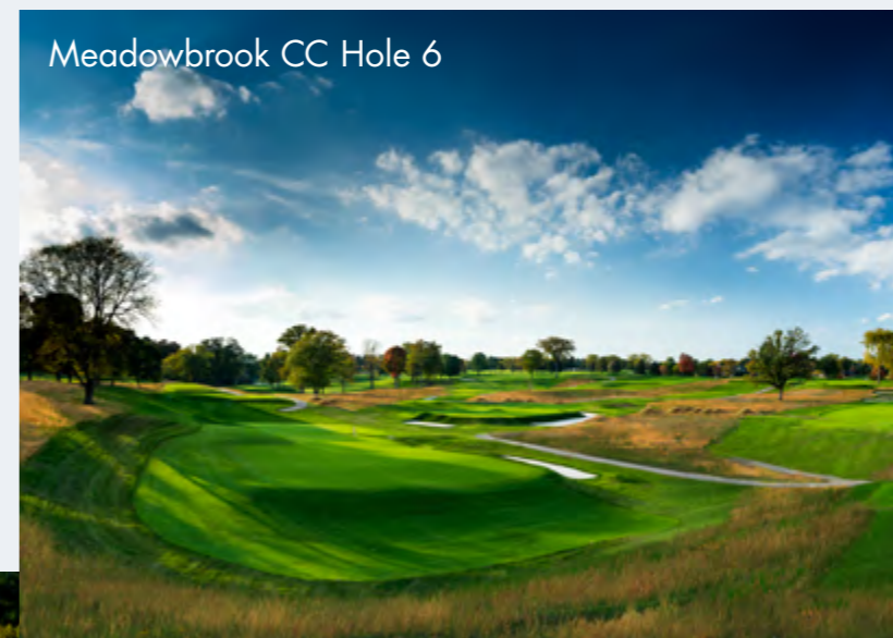
Meadowbrook CC Hole 6