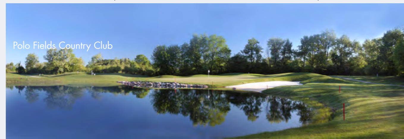
Polo Fields Country Club

While Motown earned its reputation by creating hit records by the Supremes, the Four Tops and Martha & the Vandellas, the great city has quickly and quietly become a golf destination that has visitors dancin' in both the streets and the fairways.