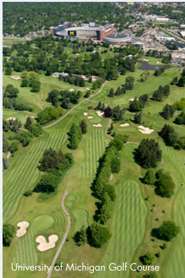
University of Michigan Golf Course

A must-play course in nearby Ann Arbor is the University of Michigan Course designed by the legendary Alister MacKenzie (Augusta National, Cypress Point). Basking in the shadows of Michigan Stadium, this outstanding layout rests on gently rolling territory garnished with conditions that are absolutely superb. This is pure MacKenzie and serves up the master's signature bunkers and green sites. Save for an ocean or a green sports jacket, there is virtually no difference between this course and the architect's most